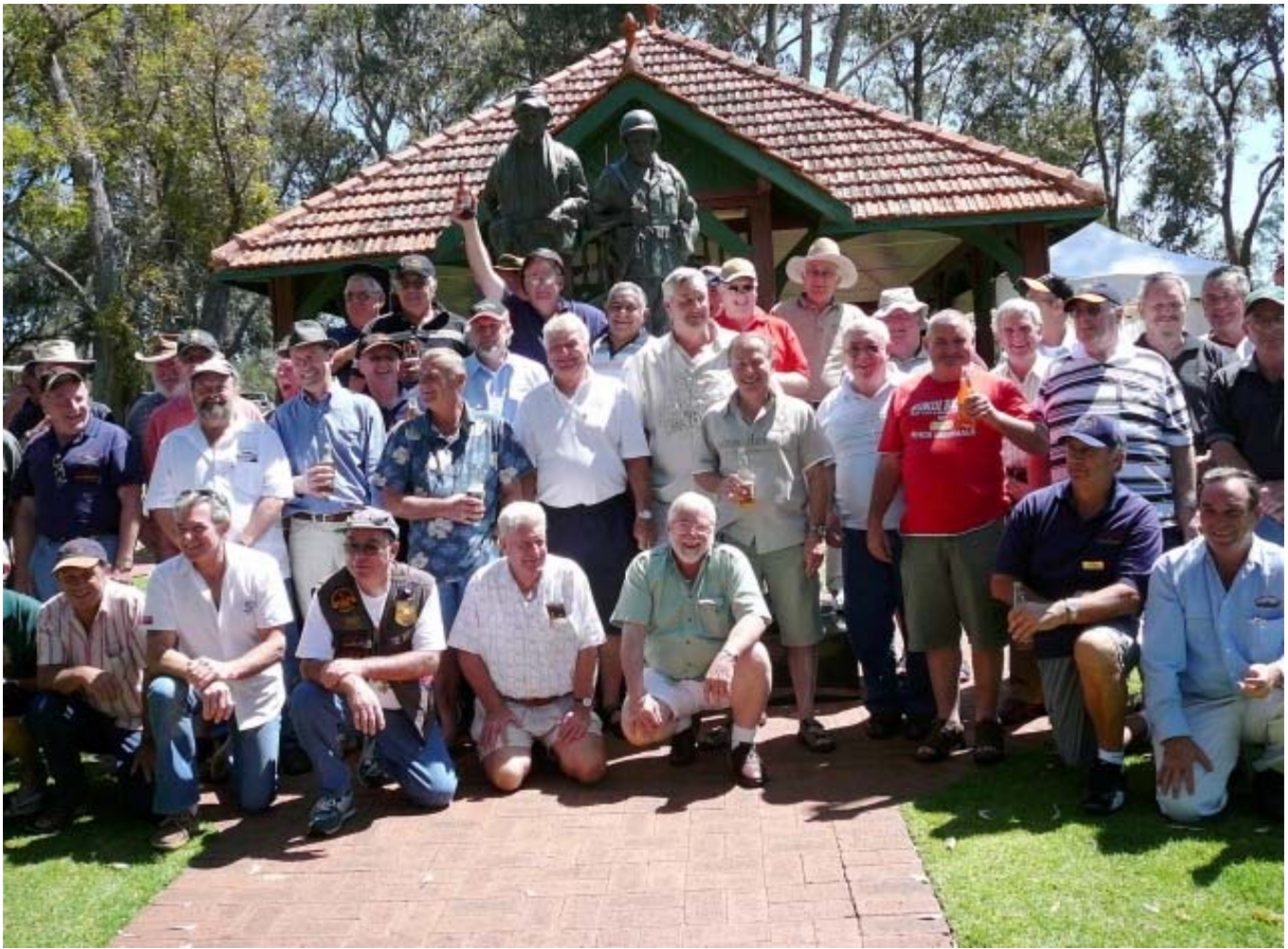
THE PERTH REUNION OCTOBER 2007