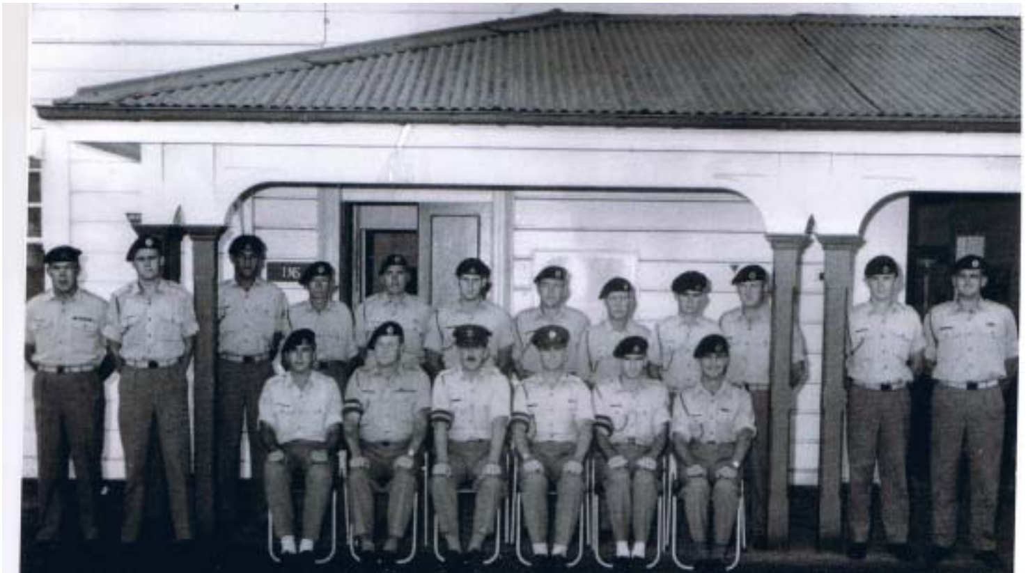
Promotion course at Chowder Bay 1967/68 ?